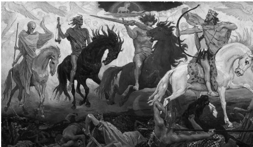
"Apocalypse vasnetsov" by Viktor M. Vasnetsov

[8] I am Alpha and Omega, the beginning and the ending, saith the Lord, which is, and which was, and which is to come, the Almighty.